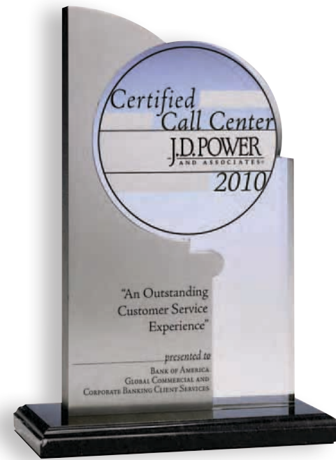
Bank of America Merrill Lynch Commercial and Corporate Banking Call Centers recognized for "An Outstanding Customer Service Experience" by J.D. Power and Associates

You can be confident that you have a banking provider committed to making it as easy and convenient as possible to do business with Bank of America Merrill Lynch. We're proud to be distinguished by our current service achievements, and remain committed to delivering a client experience that leads our industry and drives your business ahead.